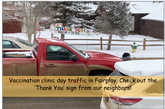
Vaccination clinic day traffic in Fairplay. Check out the 'Thank You' sign from our neighbors!

Park Health Service District, and faithful volunteers, we have assisted in the weekly vaccination clinics in Fairplay. As of this writing, over 2000 vaccinations have been administered at this clinic and that number grows every week.