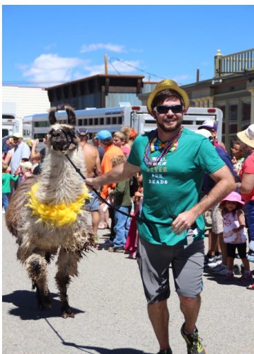
2015 LLAMA RAMA THEME WAS MARDI GRAS